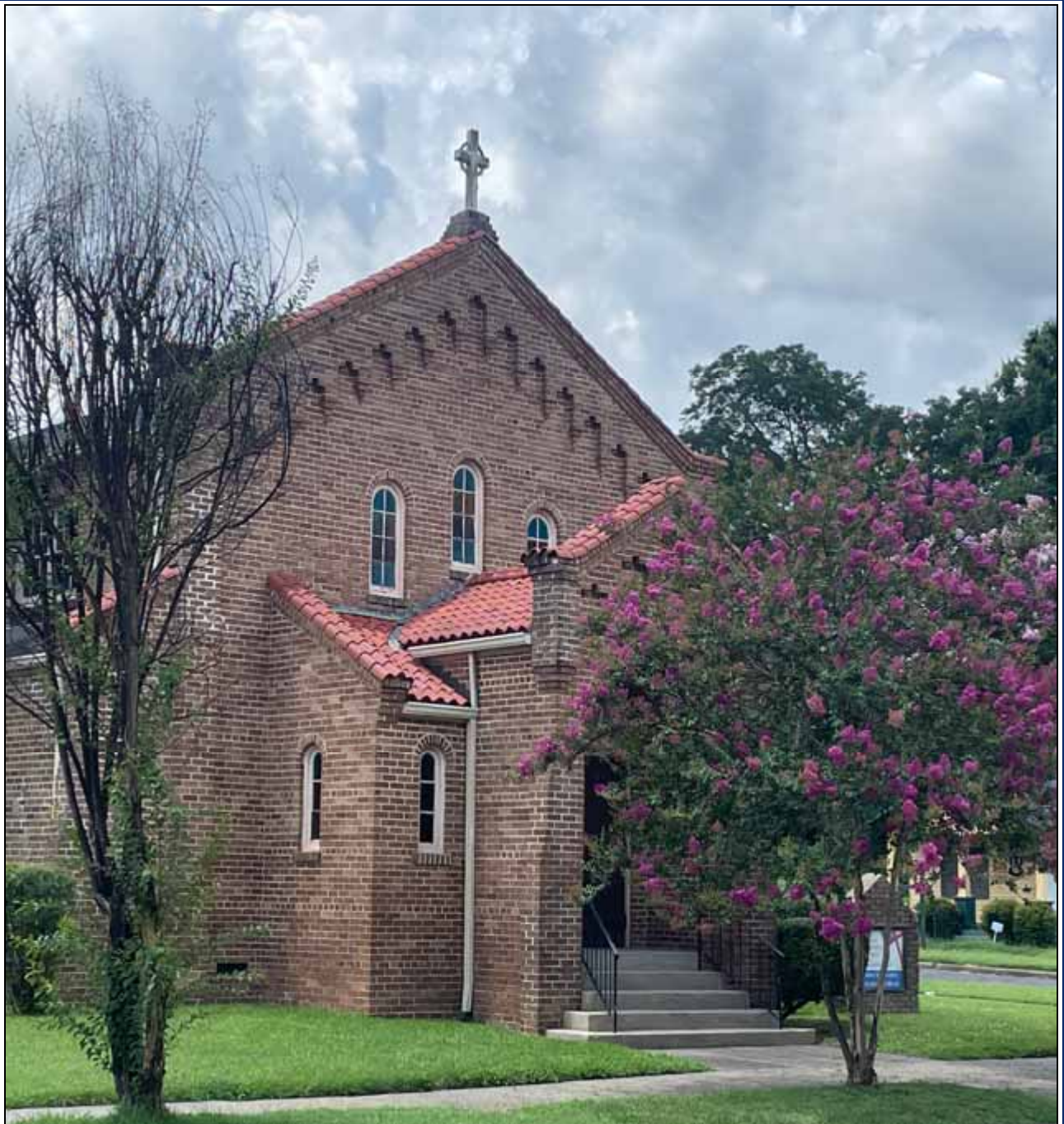
St. Mary's Episcopal Church Romanesque Revival Architecture (1928)